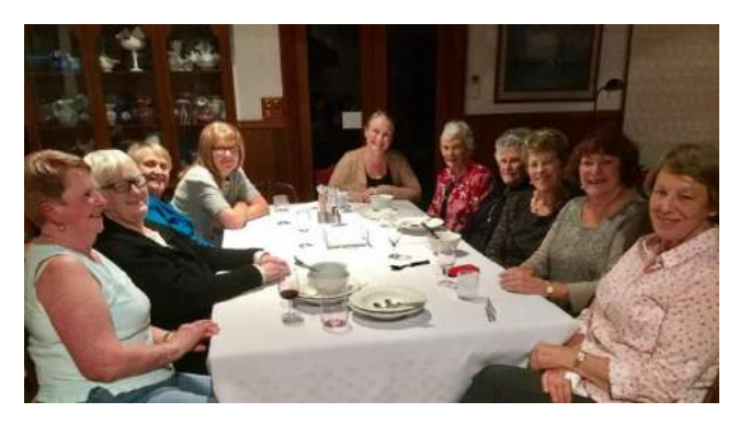
Members of the Phillip Island Inner Wheel Club at a soup and sweets night.

I had read an article in my husband's medical journal that said that 58 percent of children in Timor-Leste had stunted growth and rural children had limited food options. Our district decided to support this project. The clubs raise funds in their own way such as street stalls, BBQs, dinners, special functions or fashion parades. They then divide the money raised between projects. Our Phillip Island club has only 15 members, many of them single ladies, so I decided to have a monthly soup and sweets night . I made the soup, some of the ladies made sweets, everyone paid $15, everyone had a goodtime, and the money will help make children healthy in Timor-Leste.